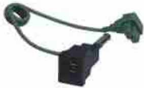
AEM® Cord Adapter, Long

(for use with EM2+ and selected 115V ConMed ESU models) (for use with EM2+E and selected 230V Covidien/Valleylab and ConMed ESU models)