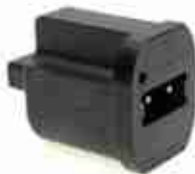
Inhibit Adapter Extension

(for use with EM2+ and selected 115V ConMed and ERBE ESU models)