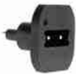
Inhibit Adapter Extension, .272x.467

(for use with EM2+ or EM2HF with selected 115V Birtcher, Bovie, ERBE, and Medtrex ESU models)