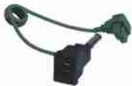
AEM® Cord Adapter