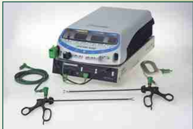
Copyright ©2008 ConMed Corporation. All rights reserved. Reprinted with the permission of ConMed Corporation.