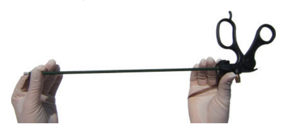
DO NOT USE OPEN BLADES TO TIGHTEN SCISSORS

2. Rotate the insert tip clockwise to screw in the insert.